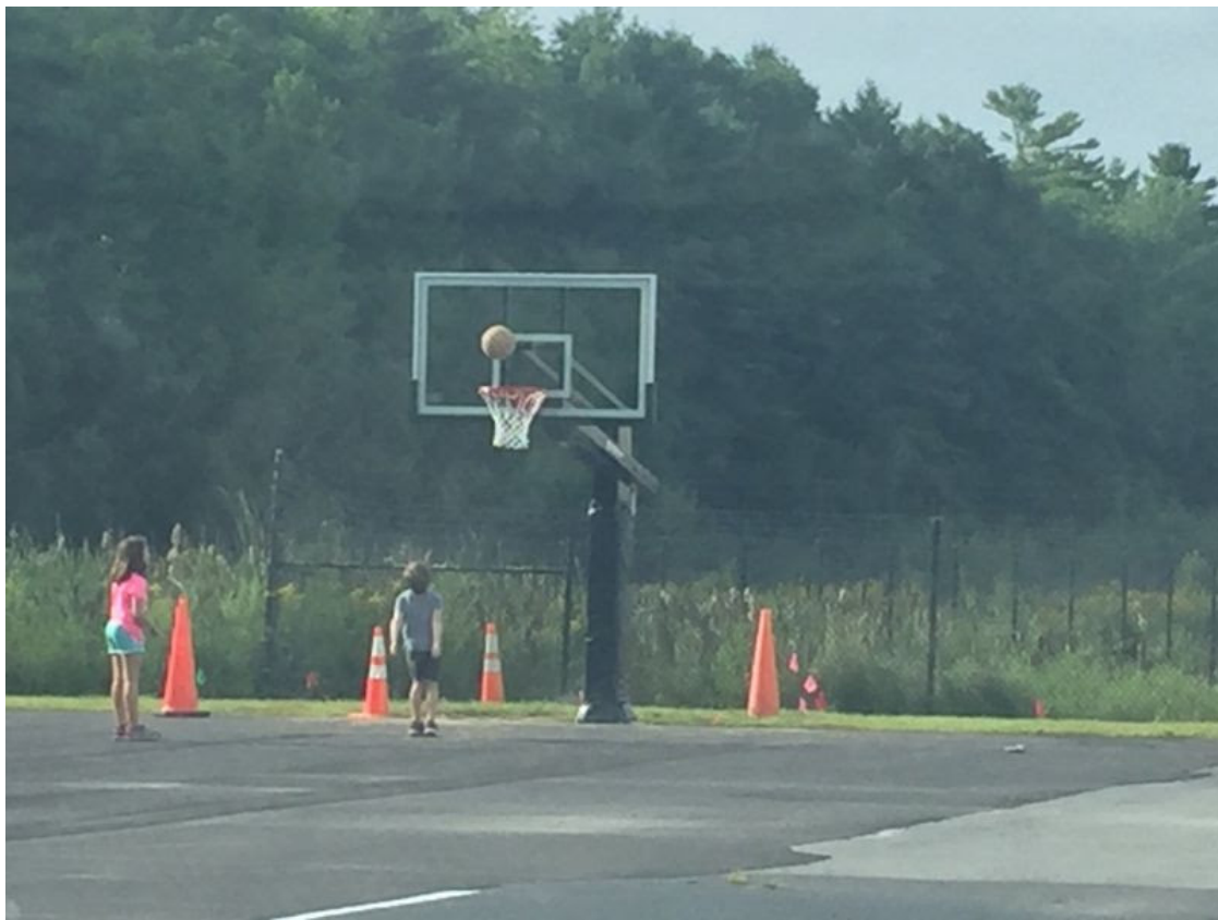
Strong new basketball hoop to welcome students back!